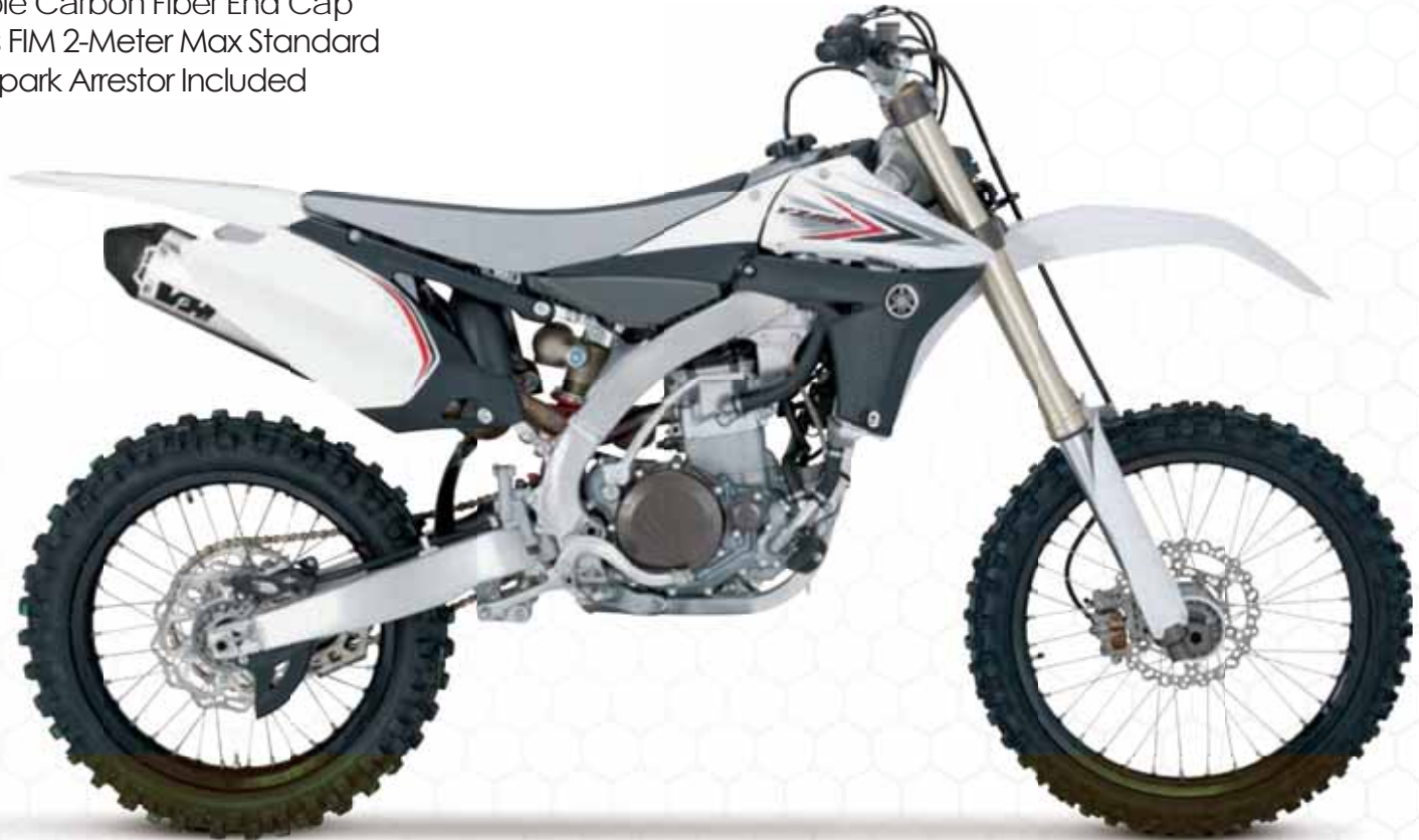
Yamaha YZ450F with Stainless Slip-On