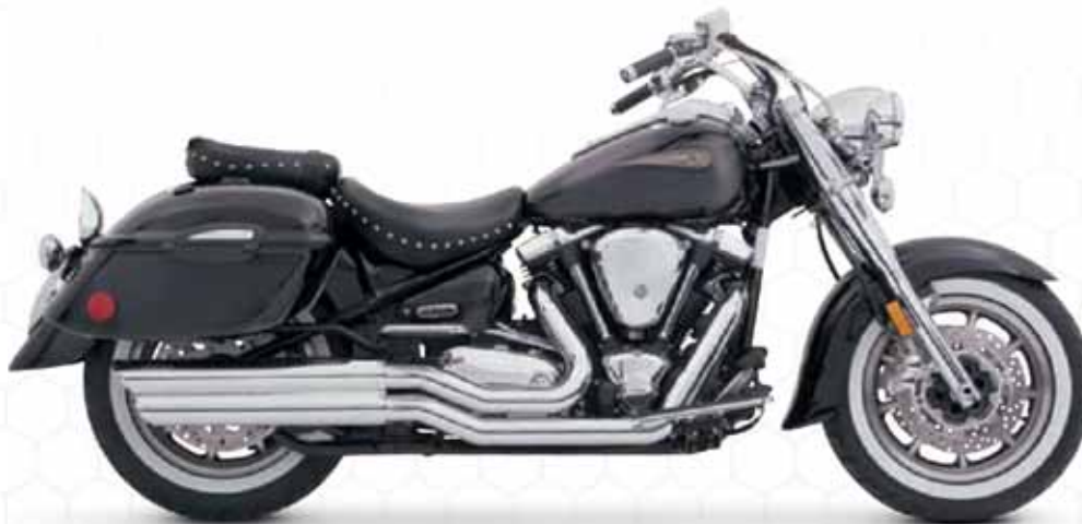
Yamaha Road Star 1700 with Powershots