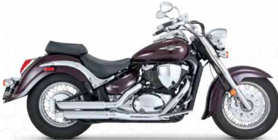
Suzuki C50 with Twin Slash Staggered