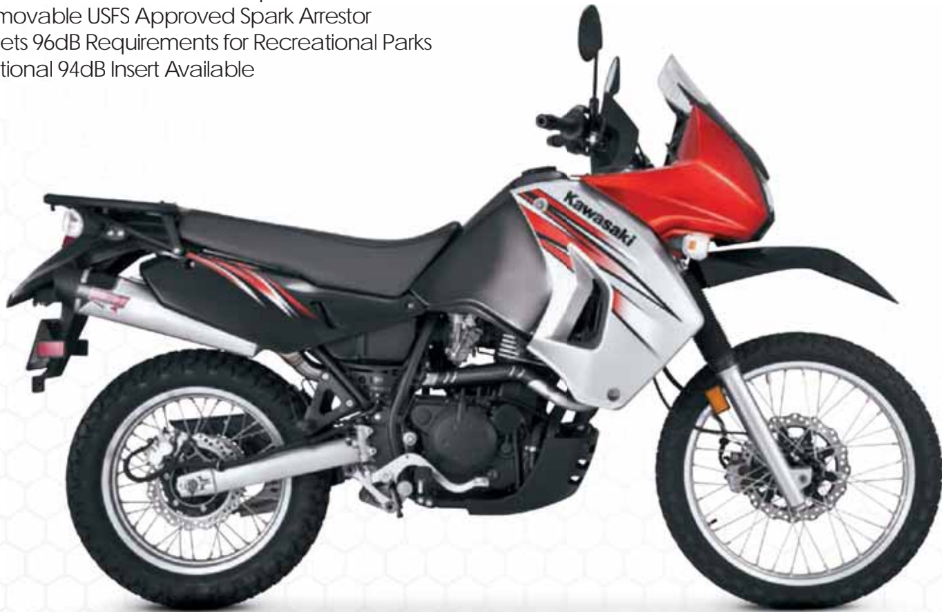
Kawasaki KLR 650 with XCR Slip-On and Head Pipe