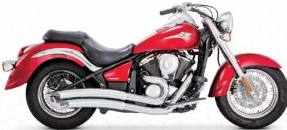
Kawasaki Vulcan 900 with Big Radius 2-into-2 PC