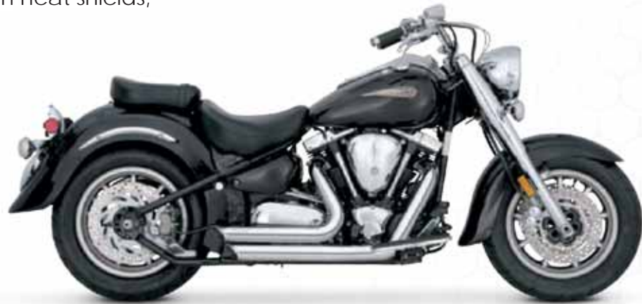
Yamaha Road Star 1700 with Shortshots Staggered