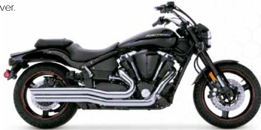
Yamaha Road Star Warrior with Big Shots