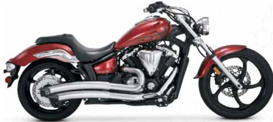
Yamaha Stryker with Big Radius 2-into-2 PC