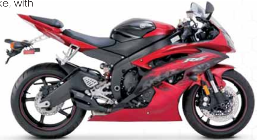
Yamaha YZF-R6 with CS One Urban Brawler Black