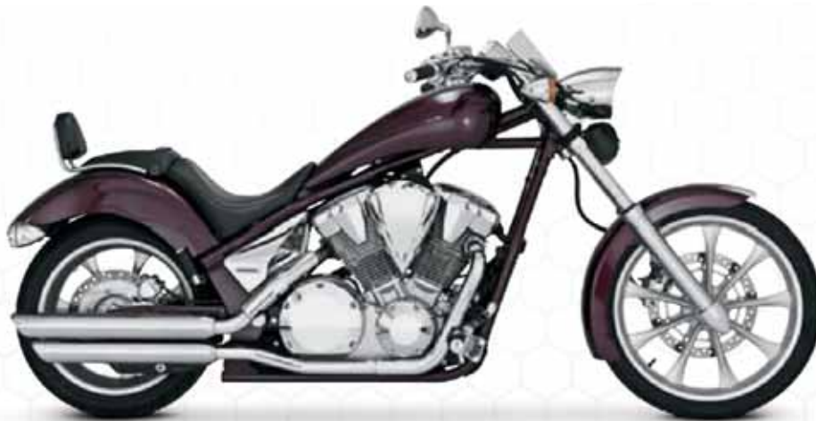
Honda Fury with Twin Slash Slip-Ons