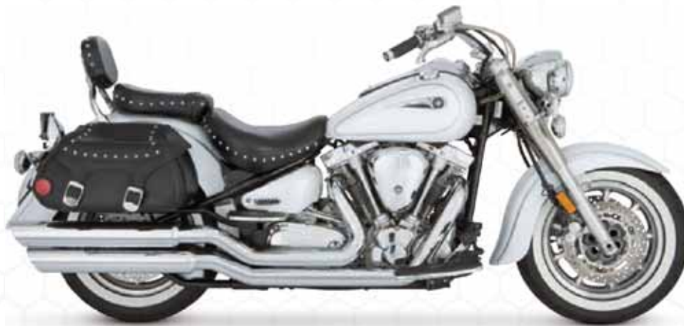
Yamaha Road Star 1700 with Big Shots