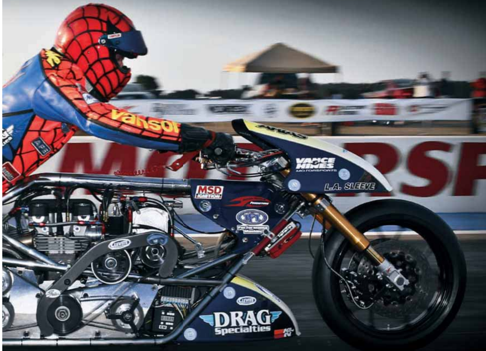
Larry McBride 11-time Champion and valued customer for over 20 years