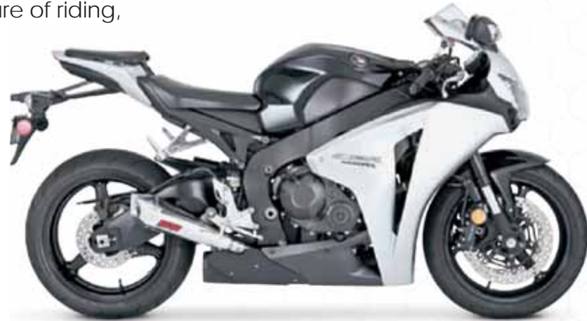
CBR1000RR with CS One Tapered