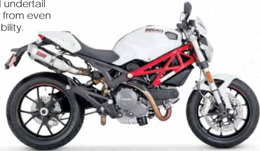
Ducati Monster 796 with CS One Dual Undertail