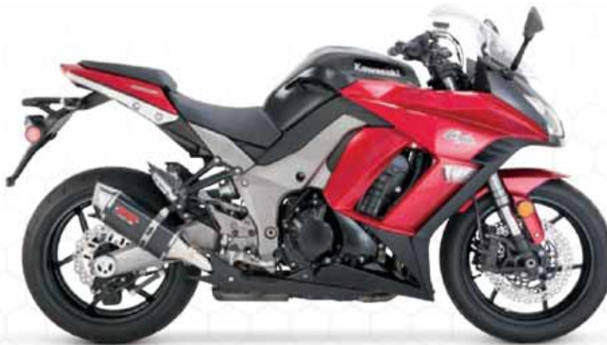
Kawasaki Ninja 1000 with CS One Dual Black