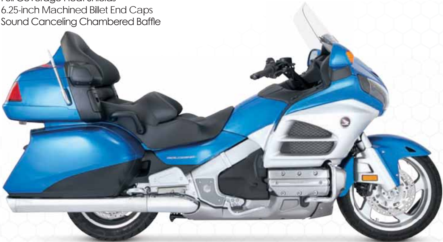
Honda GL1800 Gold Wing with GL Monster Slip-Ons