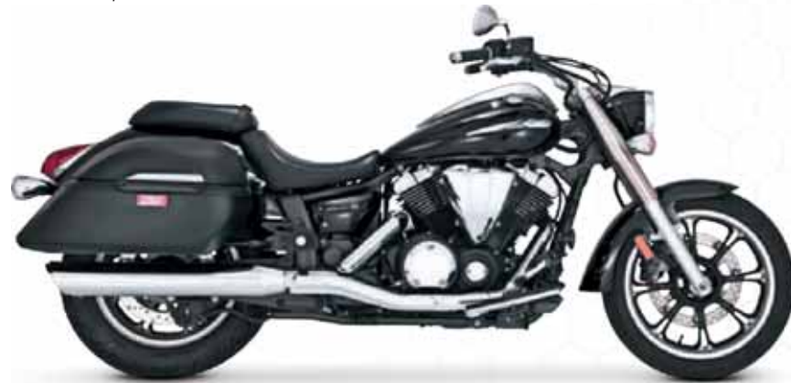
Yamaha V Star 950 with Twin Slash 2-into-1 Slip-On