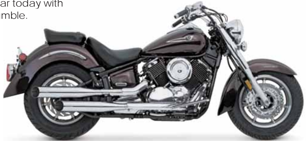
Yamaha V Star 1100 with Classic II