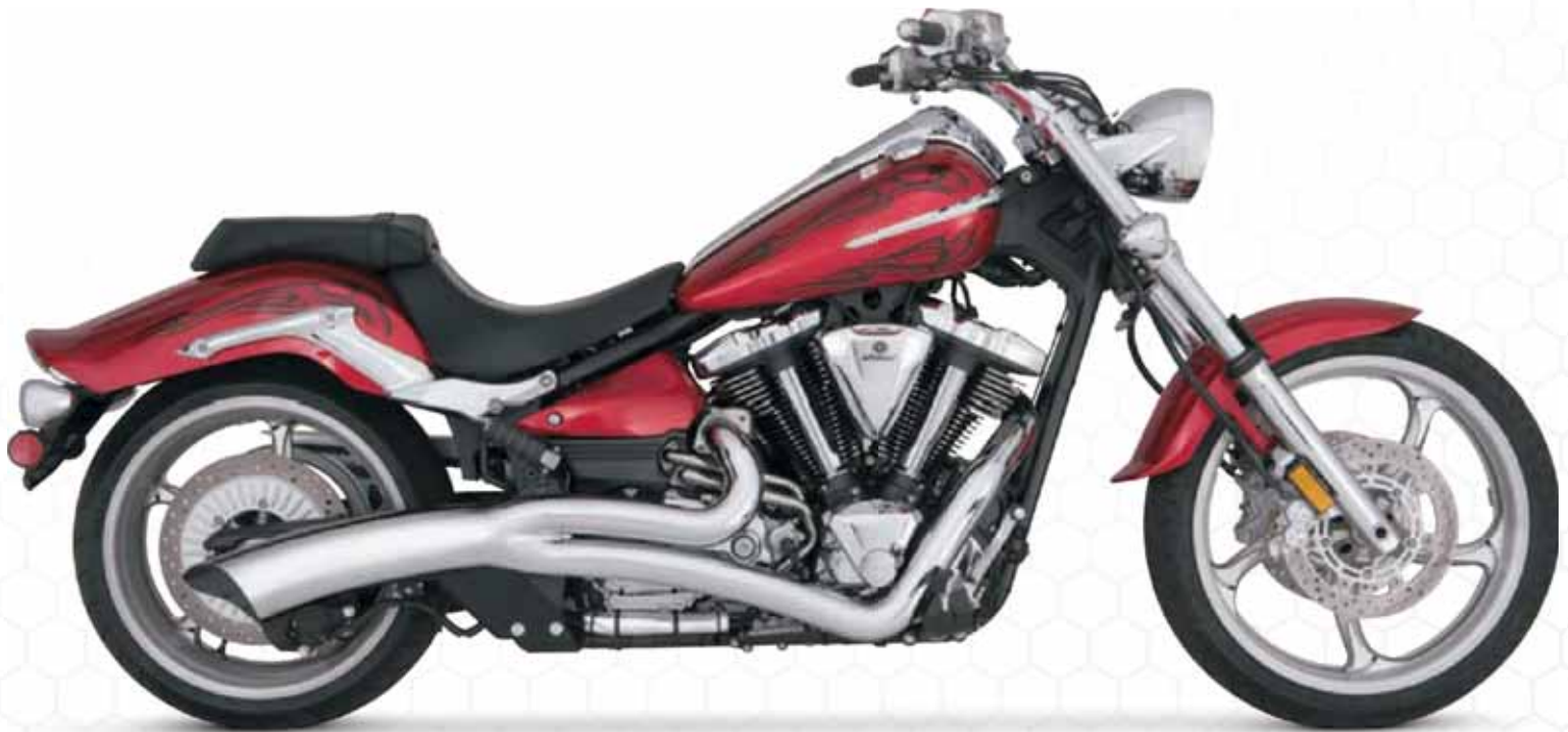
Yamaha Raider with Big Radius 2-into-1