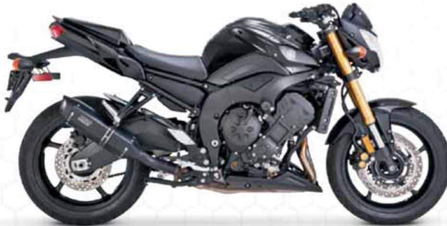
Yamaha FZ8 with CS One Blackout