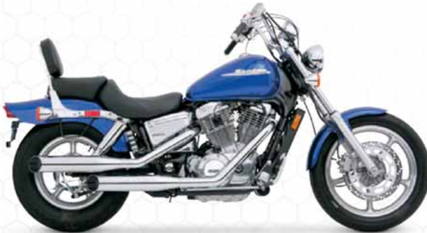
Honda Shadow 1100 with Classic II