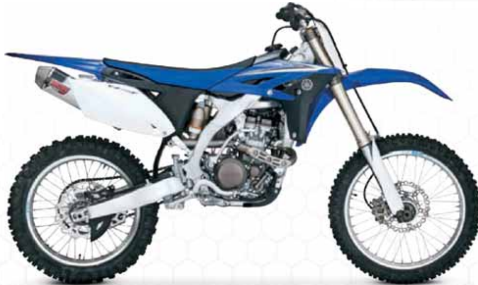
Yamaha YZ250F with Ti-Pro Slip-On