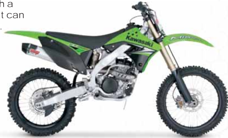
Kawasaki KX250F with XCR Slip-On