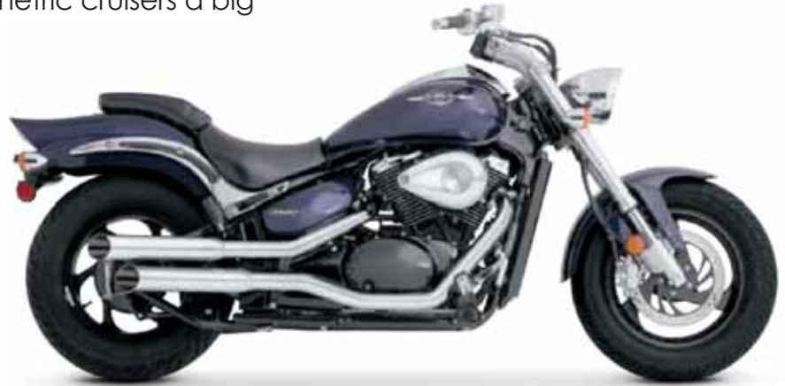
Suzuki M50 with CruZers