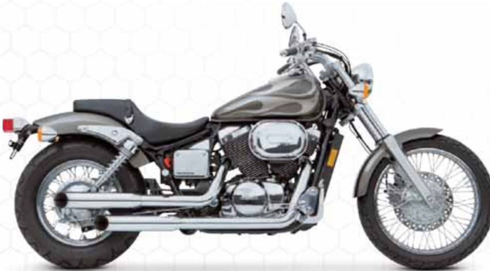
Honda 750 Spirit DC with CruZers