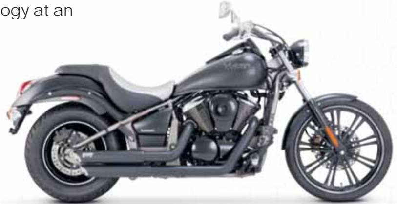
Kawasaki Vulcan 900 Custom with Twin Slash Staggered Black