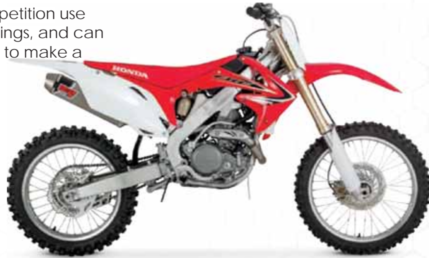
Honda CRF450R with Ti-Pro Slip-On