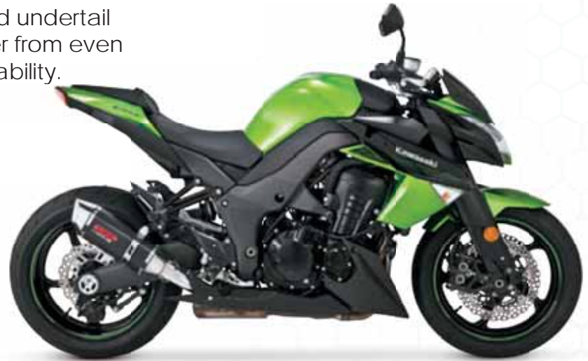
Kawasaki Z1000 with CS One Dual Black