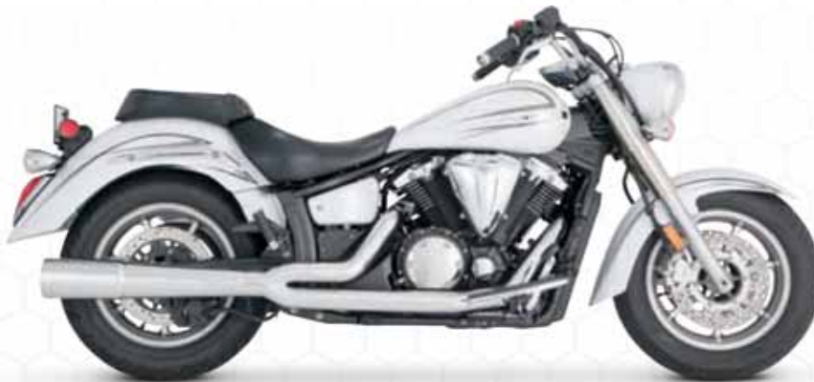
Yamaha V Star 1300 with Pro Pipe Chrome