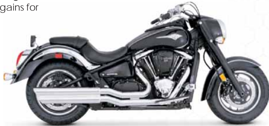
Kawasaki Vulcan 2000 with Powershots