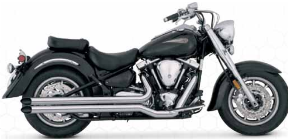
Yamaha Road Star 1700 with Longshots HS