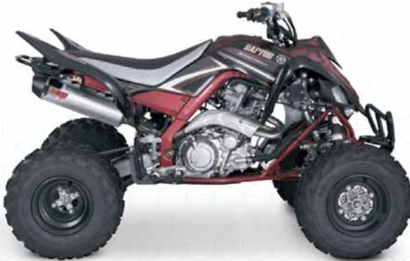
Yamaha Raptor 700 with XCR Slip-On