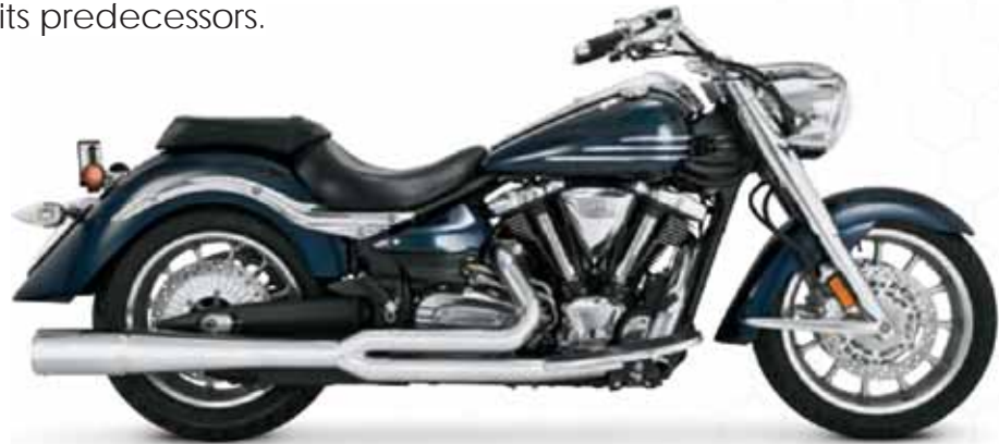
Yamaha Stratoliner with Pro Pipe Chrome