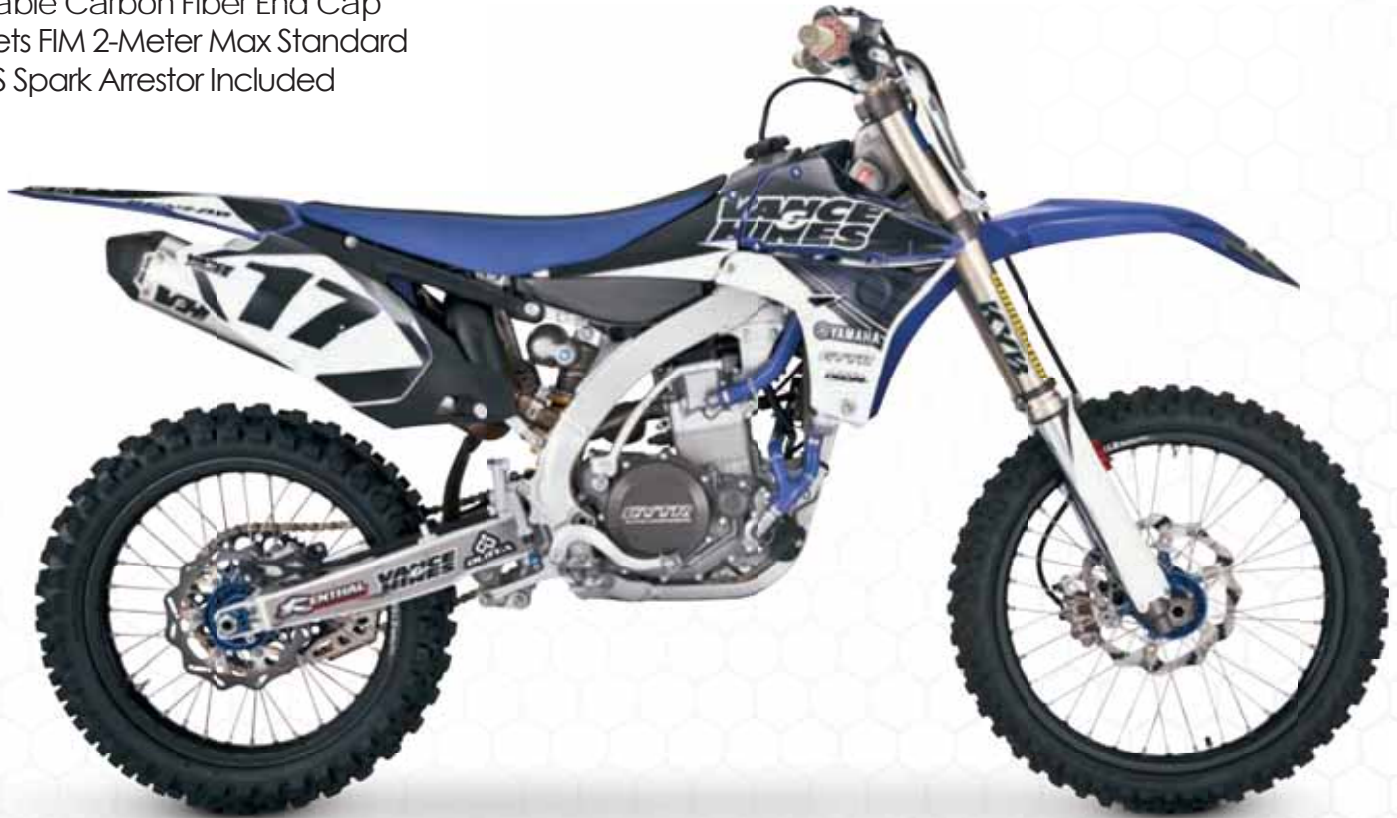
Yamaha YZ450F with Titanium Slip-On