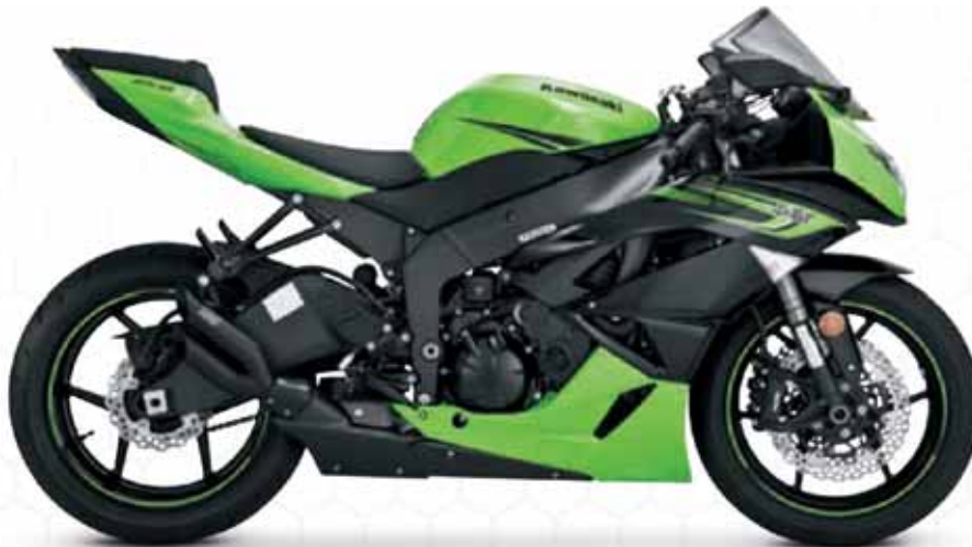
Kawasaki ZX-6R with CS One Urban Brawler Black