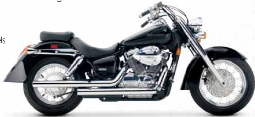
Shadow 750 Spirit C2 with Straightshots HS