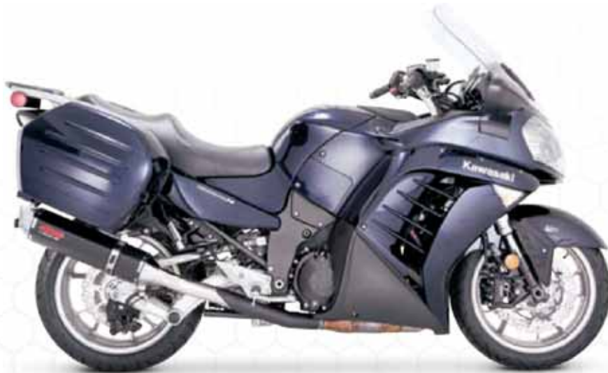
Kawasaki Concours 14 with CS One Black