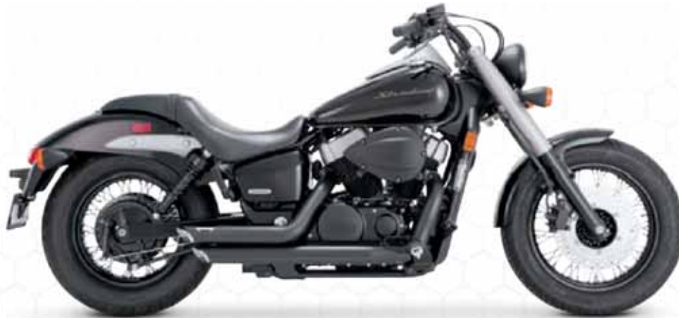
Honda Phantom with Shortshots Staggered Black